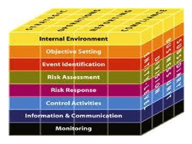
Figure 1: Enterprise Risk Management Process